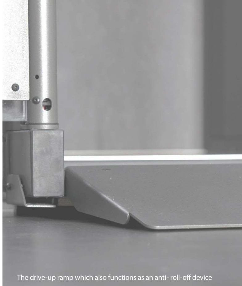
The drive-up ramp which also functions as an anti-roll-off device